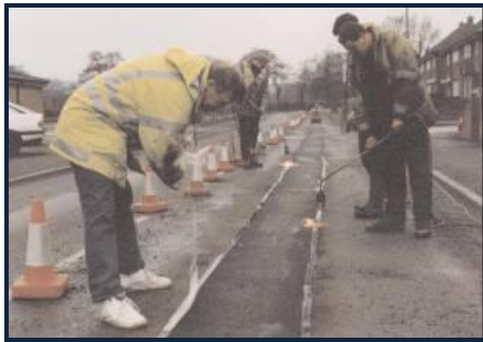
Hand application and torching of overbanding tape (Torching only necessary for wet and cold conditions)