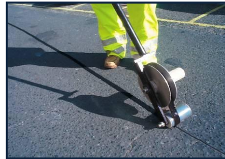
Roller application of overbanding tape