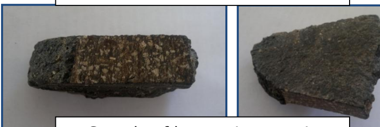
Sample of hot paving mastic