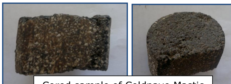
Cored sample of Coldpave Mastic

Repair to damaged bollards. Temporary repair with cold applied asphalt rejected by client and replaced with Viatec ColdPave the cold applied alternative to hot mastic asphalt.