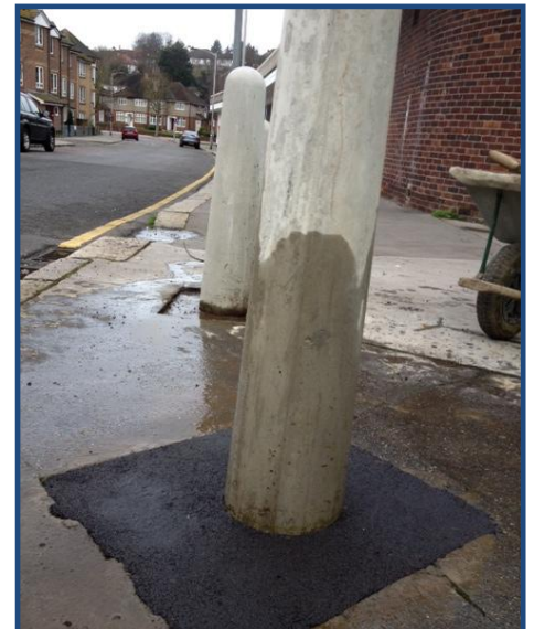
Colour match is achieved within a few weeks.

Repair to damaged bollards. Temporary repair with cold applied asphalt rejected by client and replaced with Viatec ColdPave the cold applied alternative to hot mastic asphalt.